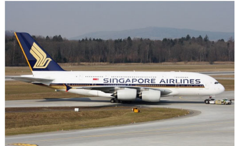
9V-SKJ – Airbus A380

As the weather forecast told about very good weather conditions for Switzerland during the second week of March, we decided to have a short visit to six different airports in Switzerland to have a look 'What's NEW and INTERESTING' in the Helvetic area...! First of all, it was the international airport of Zurich-Kloten, where we made our first stop. Traffic was normal, but several planes were quite interesting, as the following pictures show. Enjoy them.