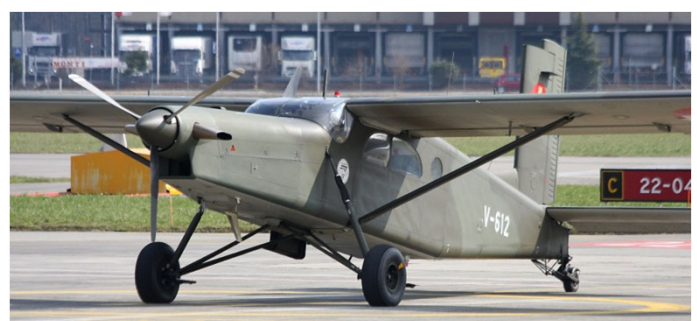
V-612 - Pilatus PC-6/B2-H2M Turbo Porter

Next airport was Emmen. Swiss Air Force had one of its bases at that airport. But unfortunately there was NO traffic that afternoon. Only one Pilatus PC-21 and a Pilatus Porter PC-6 were on the tarmac in front of the hangars.