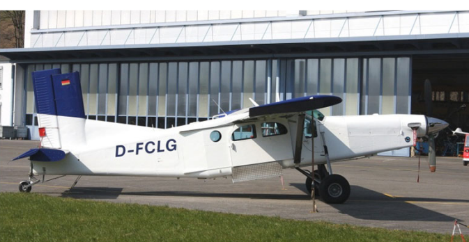
D-FCLG - Pilatus PC-6/B2-H4