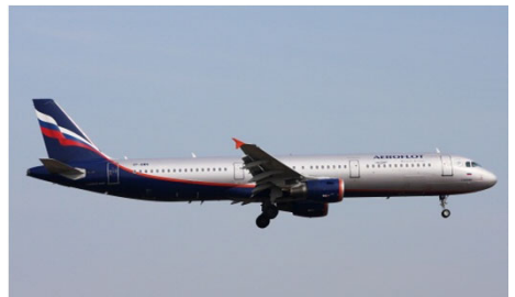
VP-BWN – Airbus A321-200