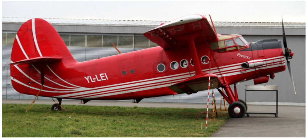
YL-LEI - Antonov An-2

On our way back to Luxemburg, we had made a stop at Birrfeld Airfield to take a picture of the famous 'Red Antonov2' based here and used for local skydiving flights.