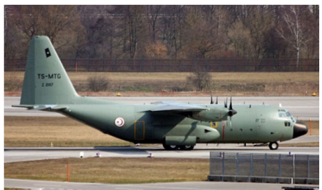
TS-MTG - Lockheed C-130 Hercules