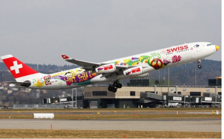
HB-JMJ - Airbus A340-300