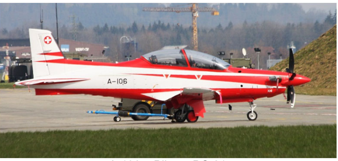
A-106 – Pilatus PC-21