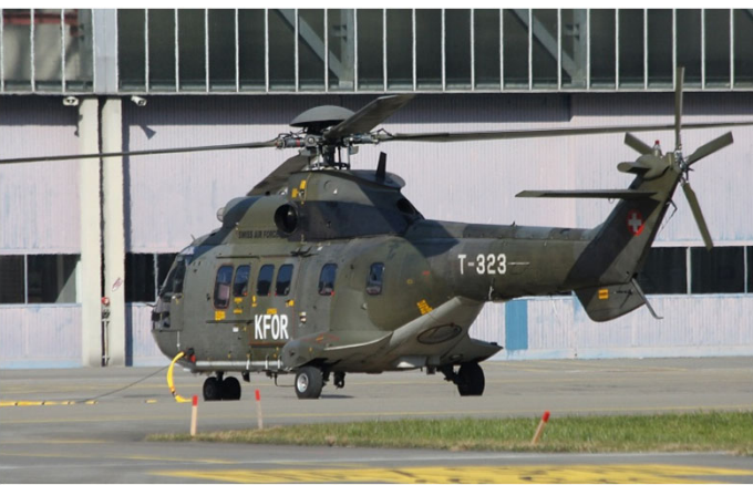
T-323 - Aerospatiale AS-332M1 Super Puma

Stans was the next airport to be visited. Manufacturer PILATUS /RUAG have its headquarter at Stans and a lot of PC-6 and PC-12 could be seen on the apron. Characteristic of Stans Airport is the famous 'crossroads', where planes, coming from Pilatus area and rolling to the runway for departure, had to cross the motorway. Road traffic is stopped for a short time by red lights.