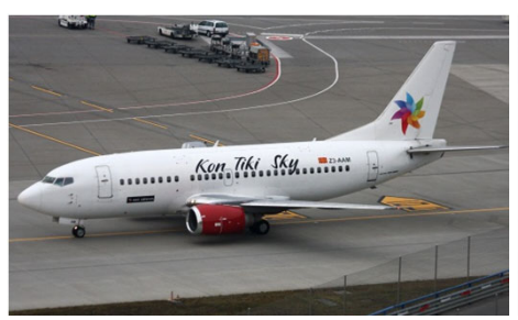
Z3-AAM - Boeing 737-500