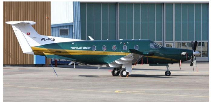
HB-FOB - Pilatus PC-12/45