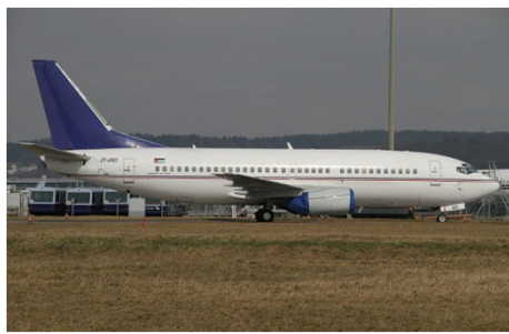
JY-JAO - Boeing 737-300