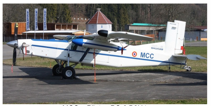
MCC - Pilatus PC-6 B2H4

Next airport was Emmen. Swiss Air Force had one of its bases at that airport. But unfortunately there was NO traffic that afternoon. Only one Pilatus PC-21 and a Pilatus Porter PC-6 were on the tarmac in front of the hangars.