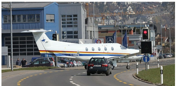
C-GMPM - Pilatus PC-12/47E

Stans was the next airport to be visited. Manufacturer PILATUS /RUAG have its headquarter at Stans and a lot of PC-6 and PC-12 could be seen on the apron. Characteristic of Stans Airport is the famous 'crossroads', where planes, coming from Pilatus area and rolling to the runway for departure, had to cross the motorway. Road traffic is stopped for a short time by red lights.