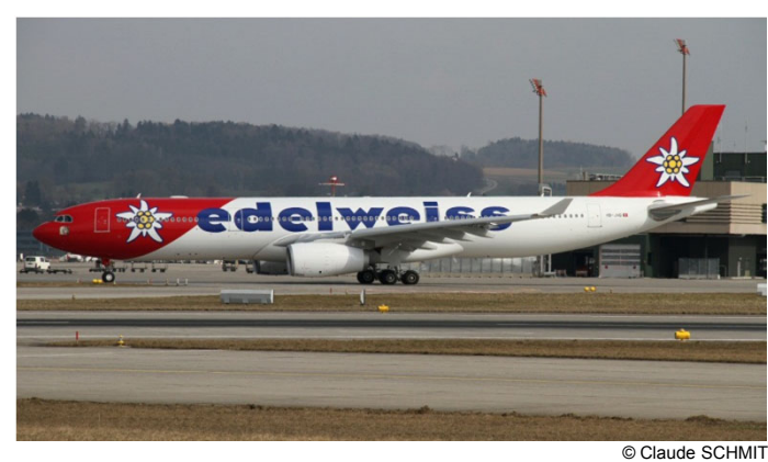
Switzerland Trip Report