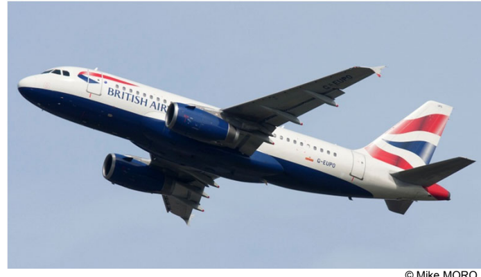
British Airways now with A319