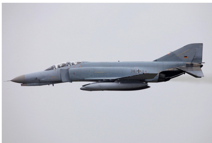
38-24 Luftwaffe - F-4F Phantom II