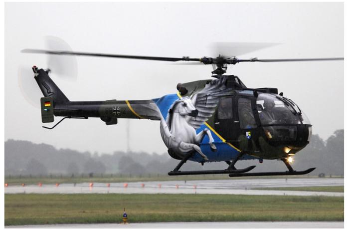
88-12 Germany Army - MBB Bo-105P