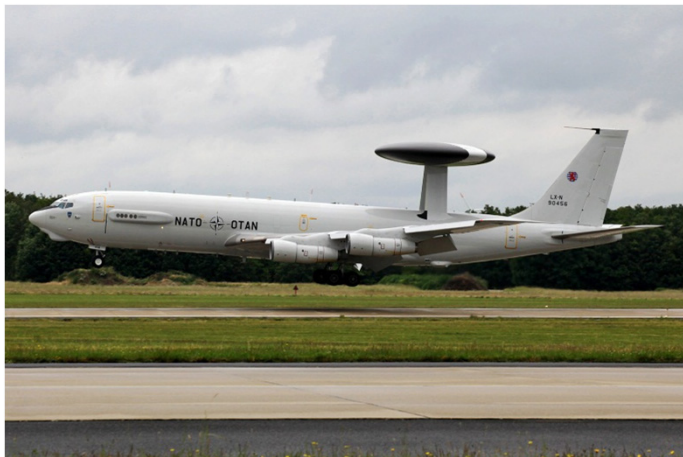
LX-N90456 NATO - E-3A Sentry (AWACS)