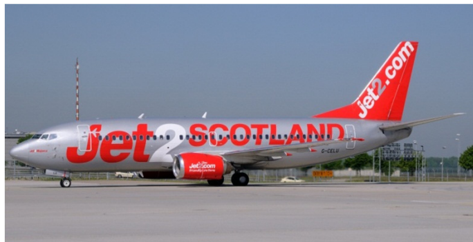
G-CELU Jet2 - Boeing 737-300