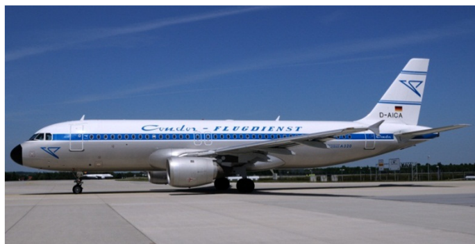
D-AICA Condor - Airbus A320-200