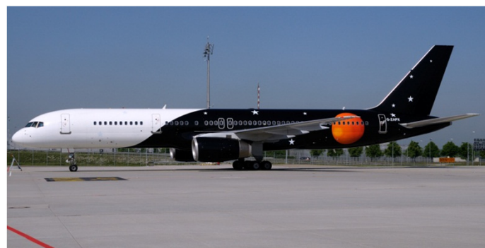
G-ZAPX Titan Airways - Boeing 757-200