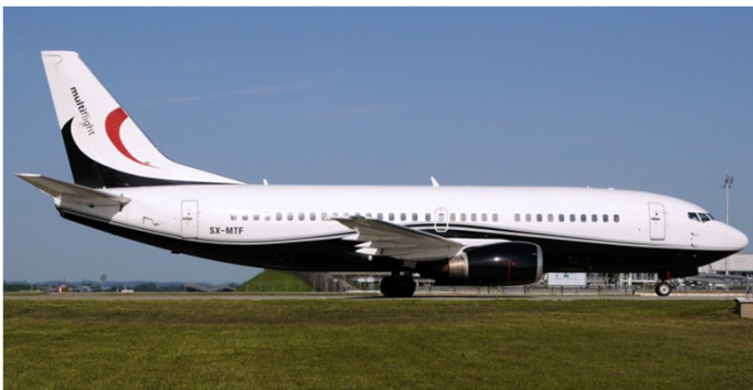
SX-MTF Gain Jet Aviation - Boeing 737-300