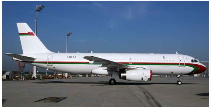
A40-AA Oman Royal Flight - Airbus A320-200