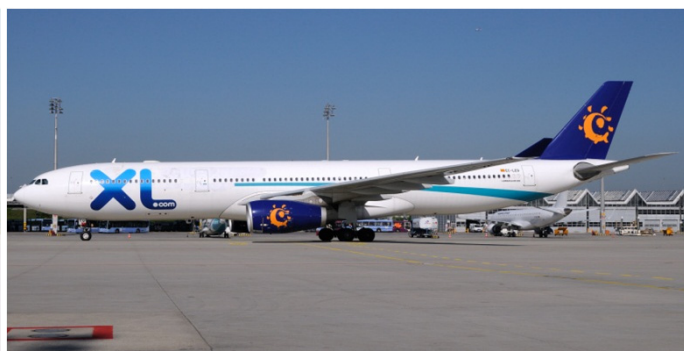
EC-LEQ Iberworld - Airbus A330-300