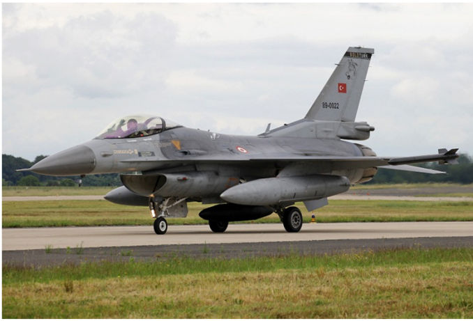
0454 Turkey - F-16C