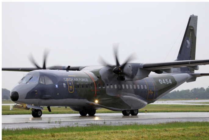
0454 Czech Republic - CASA C-295M