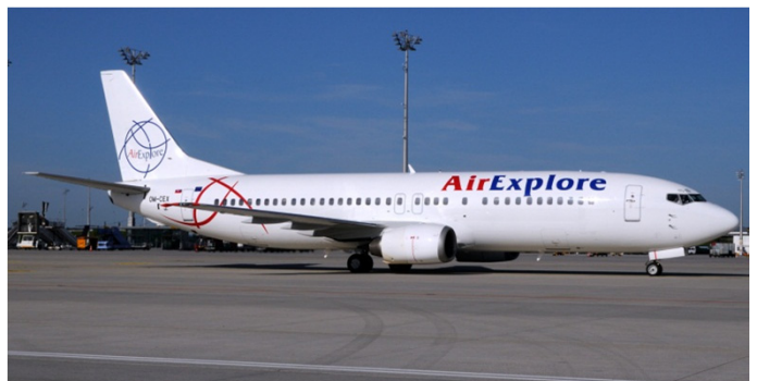
OM-CEX AirExplore - Boeing 737-400