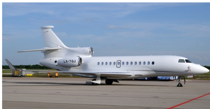
LX-TQJ Gloabl Jet Luxembourg - Dassault Falcon 7X