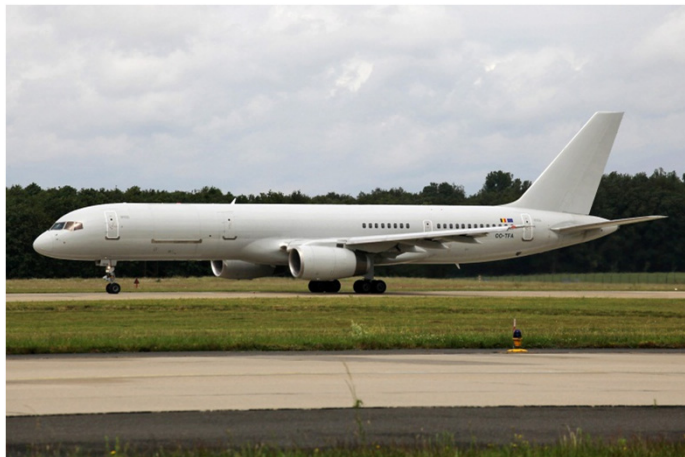
OO-TFA Belgium - Boeing 757-200

Here are some rainy impressions from the 2012 Spotter's Day at Geilenkirchen Air force Base, held on 15 th June.