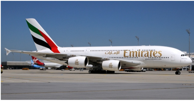
A6-EDQ Emirates - Airbus A380-800