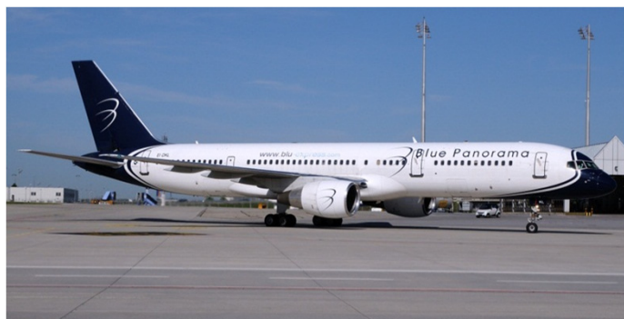
EI-DKL Blue Panorama - Boeing 757-200