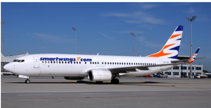
OK-TVP Travel Service - Boeing 737-800