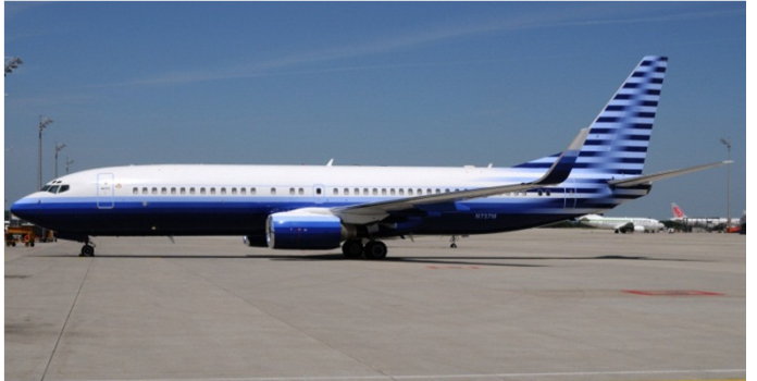
N737M EIE Eagle - Boeing 737-800