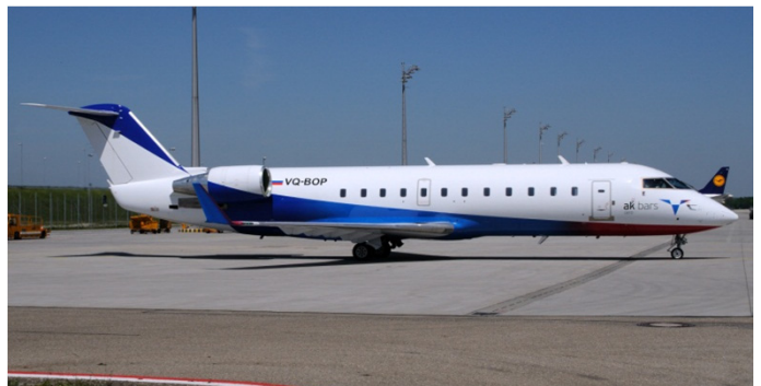
VQ-BOP Ak Bars Aero - CRJ-200ER