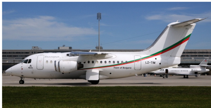
LZ-TIM Hemus Air - Avro 146 RJ-70