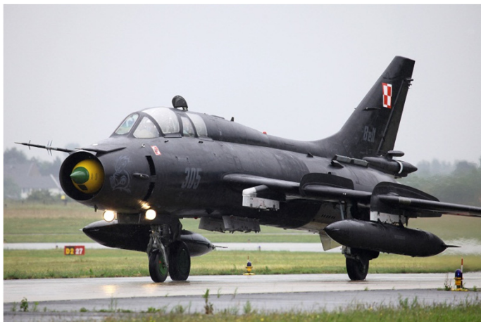
305 Poland - Sukhoi Su-22UM3K