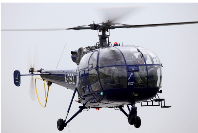
A292 Netherlands - Sud Aviation SE-3160