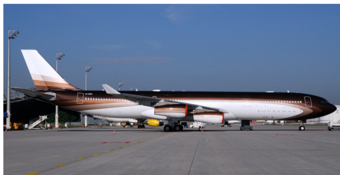
M-IABU Klaret Aviation - Airbus A340-300