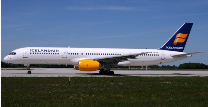
TF-FIC Icelandair - Boeing 757-200