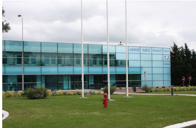
Passenger Terminal of Chateauroux Airport