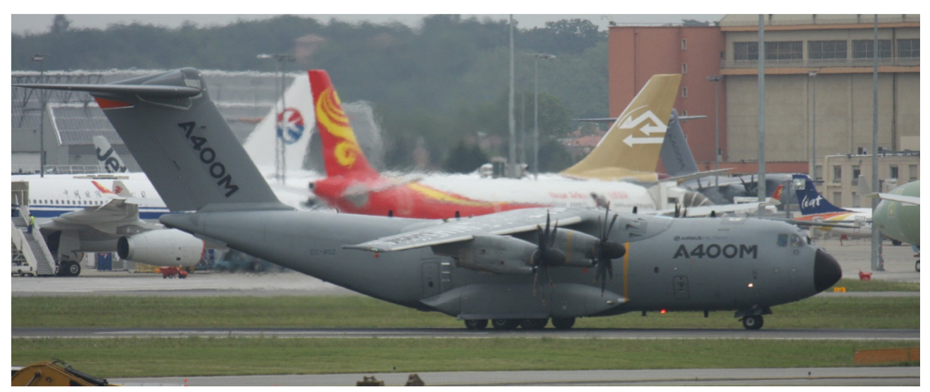
EC-402: Test Flight of an Airbus A400M Military Transporter (Dozens of Touch and Go)