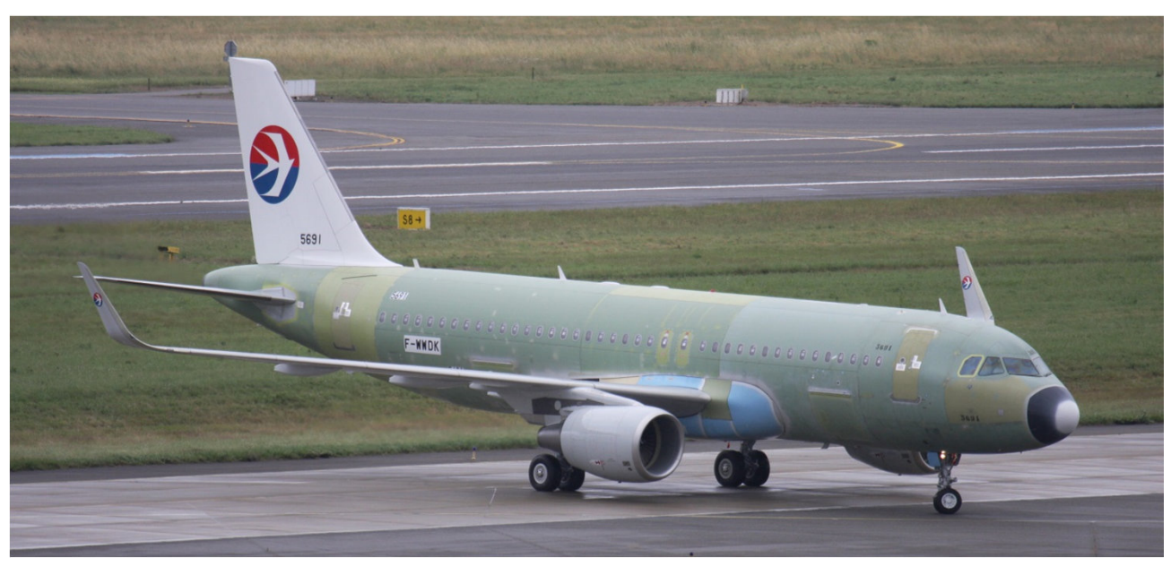
Still in primer colors, this A320 (B-9941) of China Eastern. (On a ground rolling test)