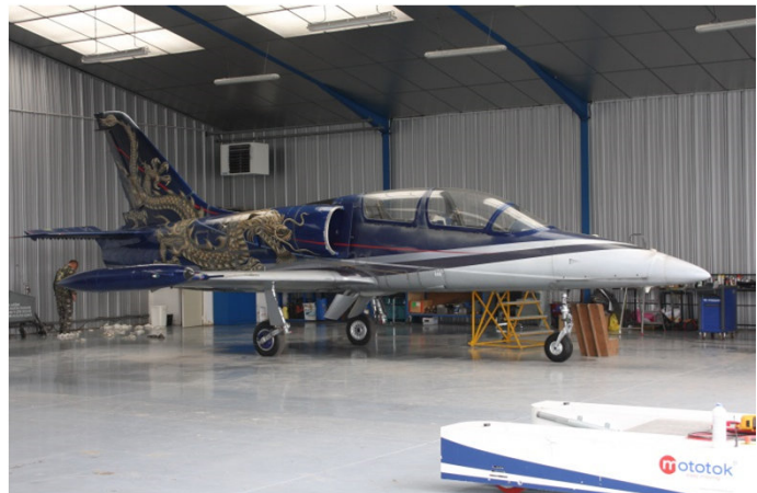
LX-STN Aero L-39 Albatros (private and also based at Reims) in special dragon colors

We hope you had enjoyed the pictures. Part 3 will come soon showing pictures of museum planes at Bordeaux, Toulouse and La Ferté Alais.