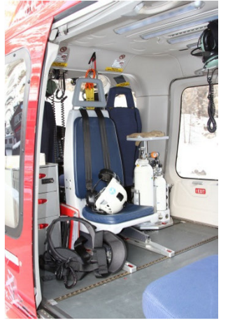
HB-ZEF, Eurocopter Ec-135 T2