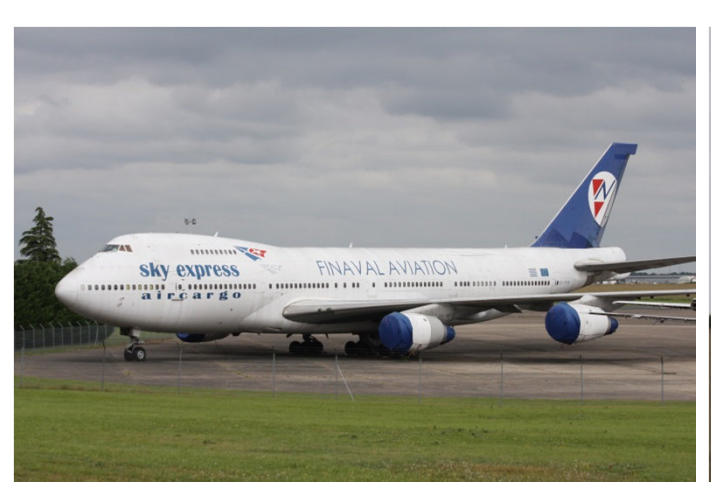
SX-FIN Boeing 747-200 of Finaval Aviation (stored) (was ex: LX-OCV of CARGOLUX mid 80's)