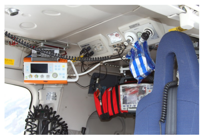
Interior and equipment of the Bell 429