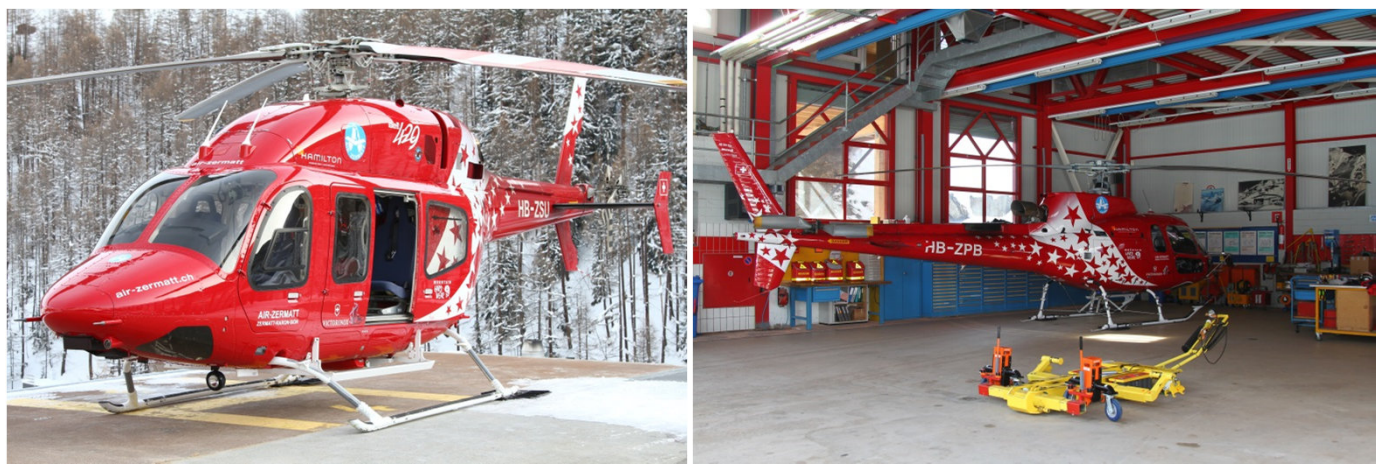
HB-ZSU, Bell 429

Currently 2 helicopters are used for rescue missions and are fully equipped and ready all the time. First the new Bell 429, HB-ZSU and second the Eurocopter HB-ZEF. All the other aircrafts are mainly used for sightseeing, heli-skiing or transport flights.