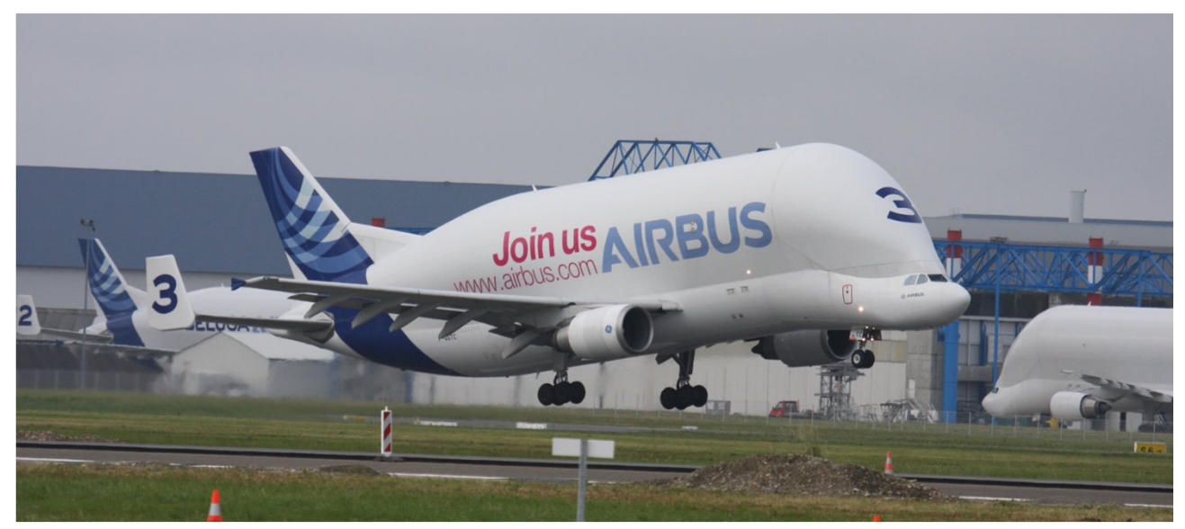
Take off of an Airbus A300B4-608ST BELUGA SUPER TRANSPORTER (with JOIN US titels). (Just check three Belugas on one picture...!)