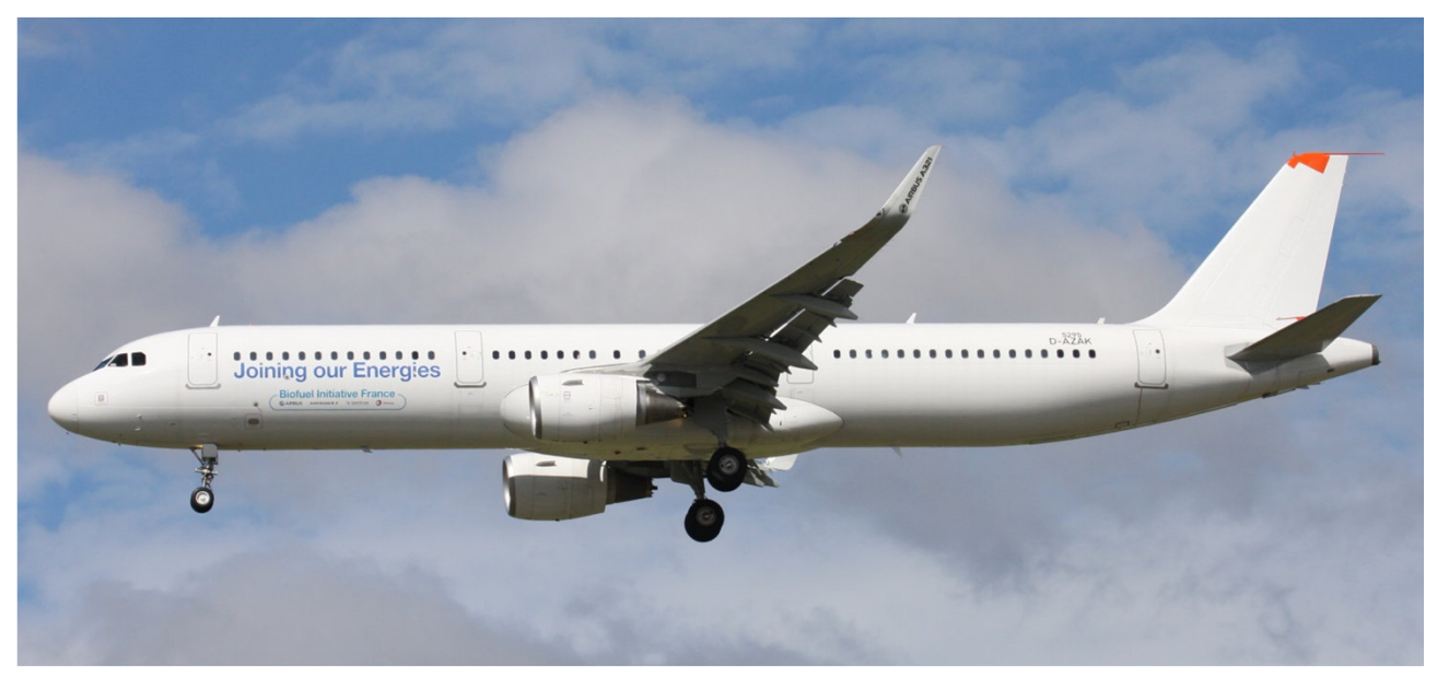
D-AZAK: Special test flight with biofuel by this A321 with sharklets (in cooperation with AIRBUS, AIR FRANCE, SAFRAN and TOTAL.