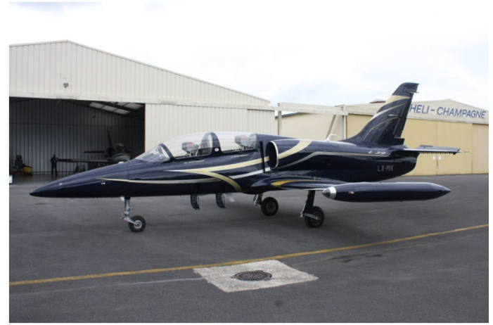
LX-MIK Aero L-39 Albatros (private and based at Reims) often visiting ELLX...!