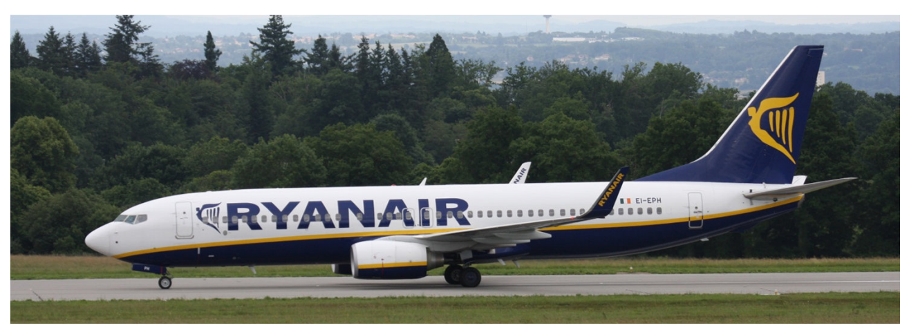
EI-EPH Boeing 737-800 of Ryan Air coming from East Midlands