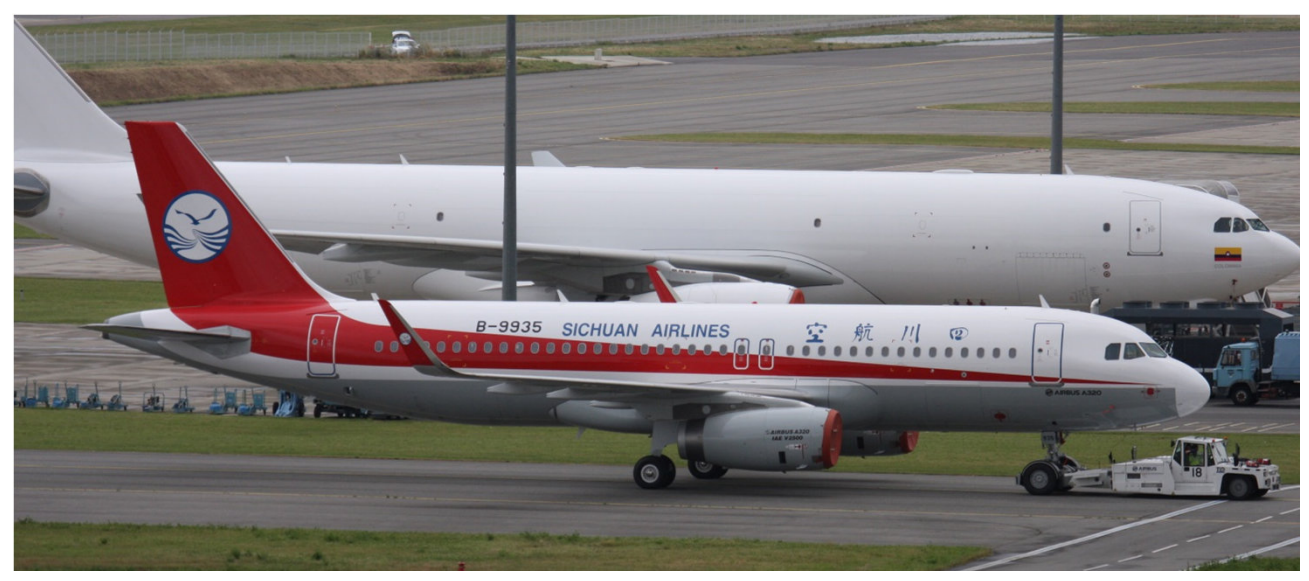
A320 (B-9935) of Sichuan Airlines (just prior delivery)