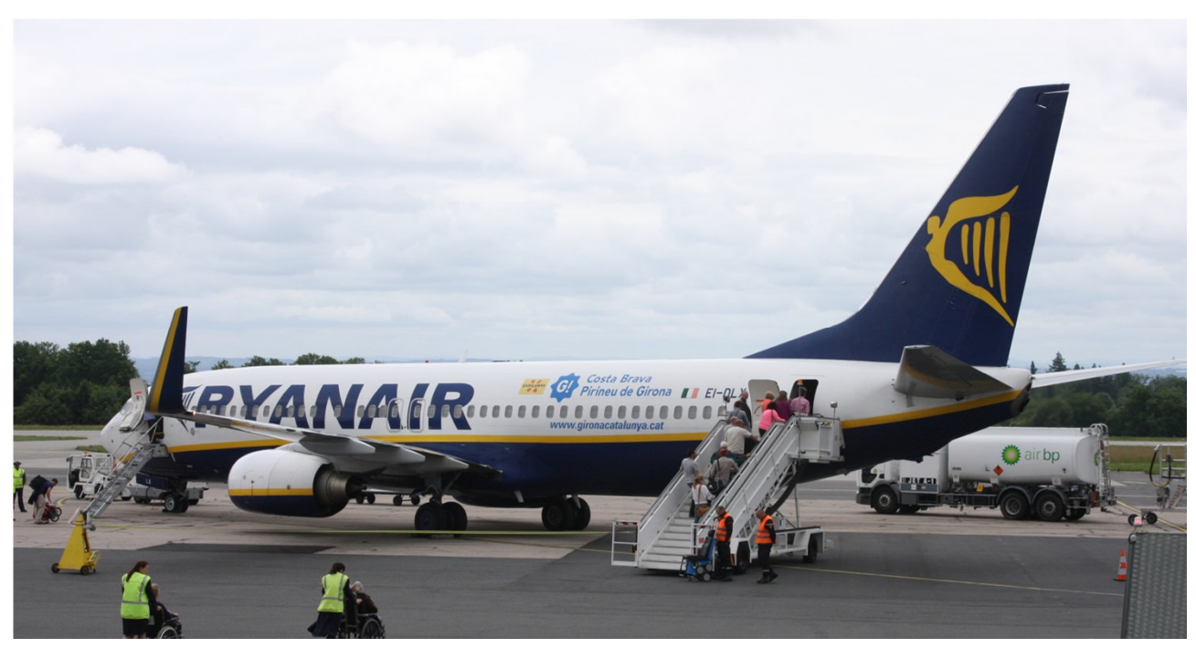
EI-DLX Boeing 737-800 of Ryan Air departing to London Stansted