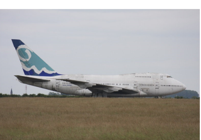
F-GTOM (ex: LX-ACO) Boeing 747SP of Corsair (will be scrapped soon) VERY SAD...!