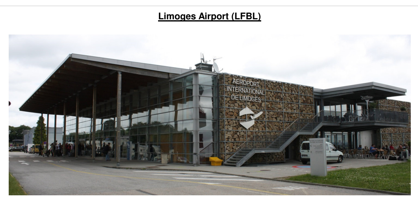
Passenger Terminal of the small LIMOGES AIRPORT