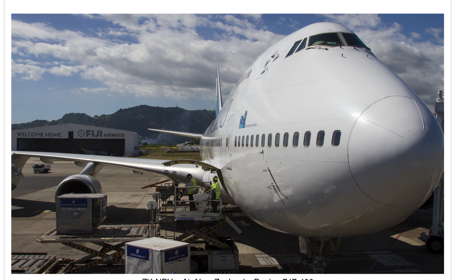
ZK\text{-NBV}-Air\ New\ Zealand-Boeing\ 747\text{-}400

After a short stay at the Fiji Island, it was time to go home again, via Auckland and Singapore.