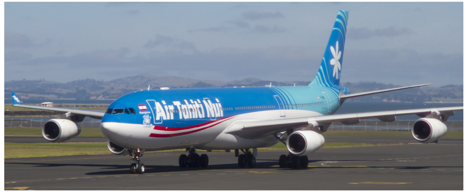
F-OSEA – Air Tahiti Nui – Airbus A340-300