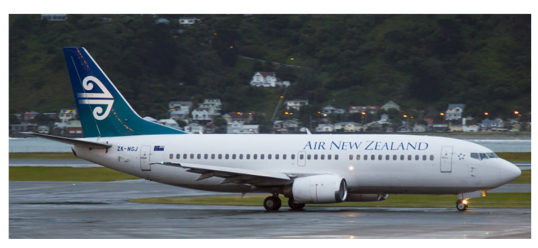
ZK-NGJ - Air New Zealand - Boeing 737-300