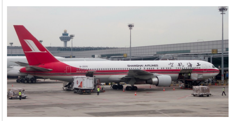
B-2500 - Shanghai Airlines - Boeing 767-300