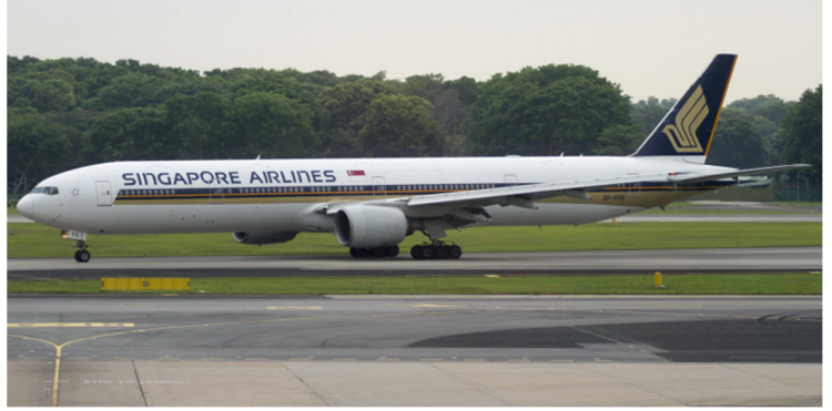
9V-SYG – Singapore Airlines – Boeing 777-300

Quite a variety here at Changi Airport, going from Qantas, Jetstar Asia to Drukair (Bhutan) and French Air Force.