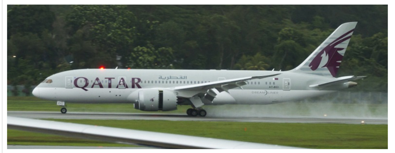
A7-BCI - Qatar Airways - Boeing 787-8 Dreamliner