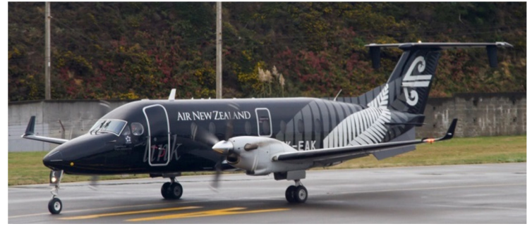
ZK-EAK – Air New Zealand Link – Beech 1900