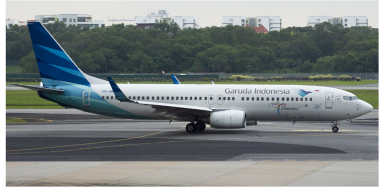
PK-GMO - Garuda Indonesia - Boeing 737-800