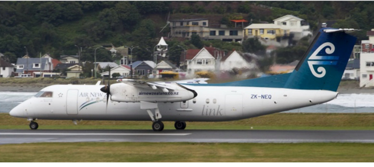
ZK-NEQ - Air New Zealand Link - DHC-8-311 Dash 8