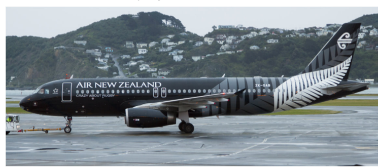
ZK-OAB - Air New Zealand - Airbus A320-200