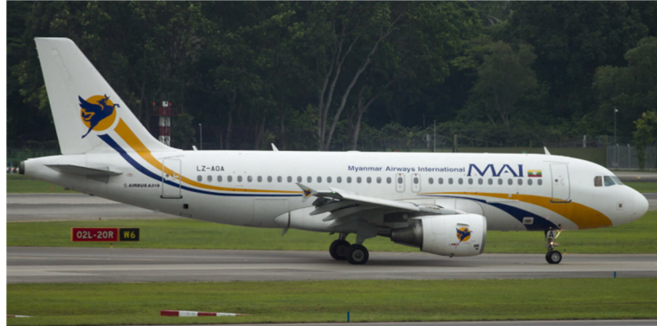
LZ-AOA – Myanmar Airways – Airbus A319-100