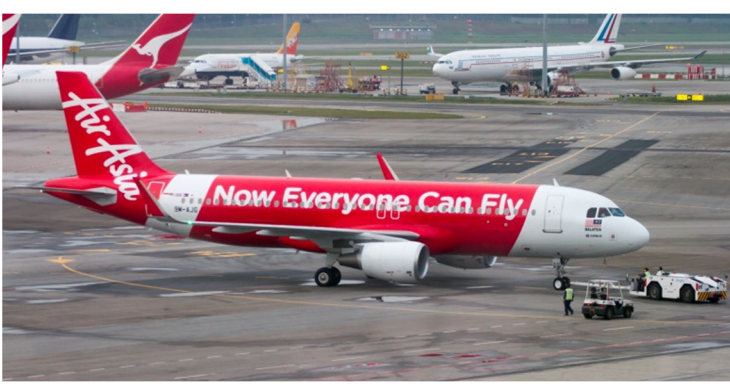
9M-AJG - Air Asia - Airbus A320-200