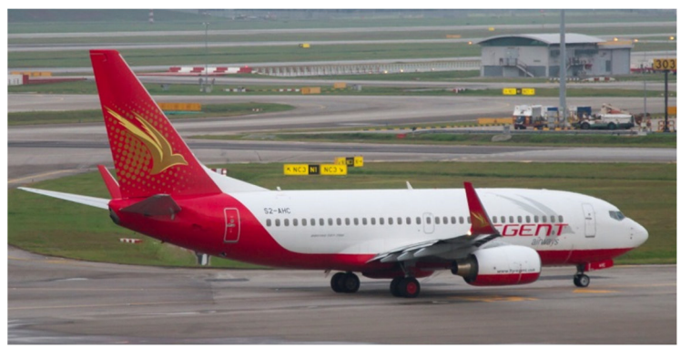
S2-AHC - Regent Airways - Boeing 737-700