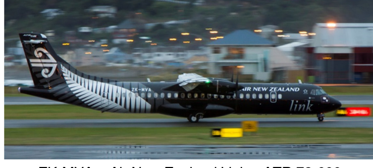
ZK-MVA - Air New Zealand Link - ATR 72-600