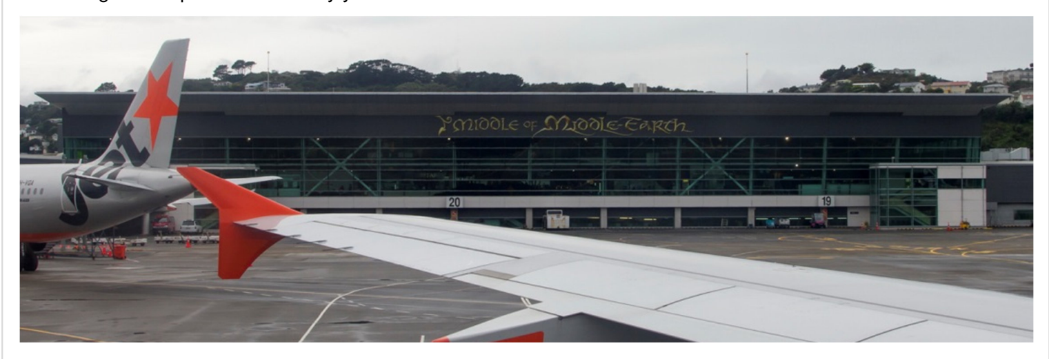
...even Sméagol made it to the airport terminal. Huge and ugly ©