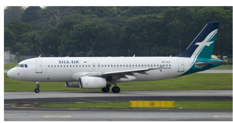
9V-SLK - Silkair - Airbus A320-200