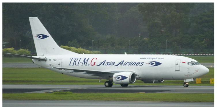
PK-YGG - Tri-M.G. Asia Airlines - Boeing 737-300