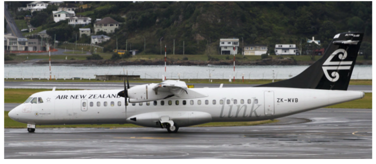
ZK-MVB - Air New Zealand Link - ATR 72-600