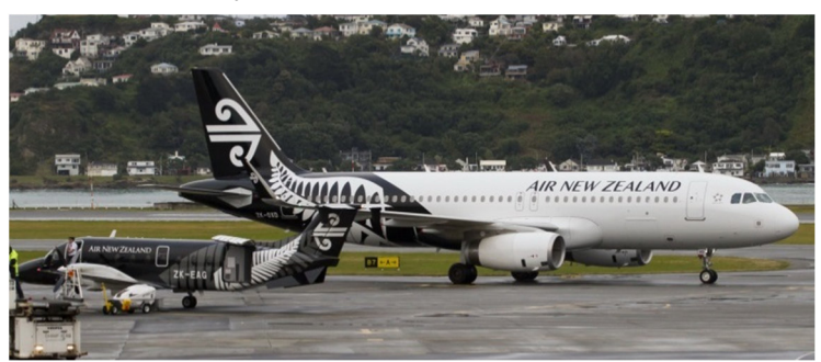
ZK-OXD - Air New Zealand - Airbus A320-200

Below the variety of the different Air New Zealand color schemes and aircrafts flying around, unbelievable!!!