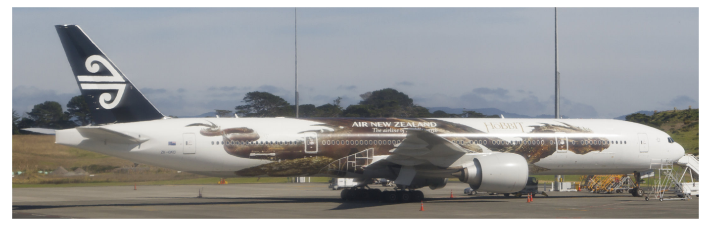
ZK-OKD - Air New Zealand Boeing 777-200

Seconds after landing you know you are in New Zealand. Hobbits everywhere.