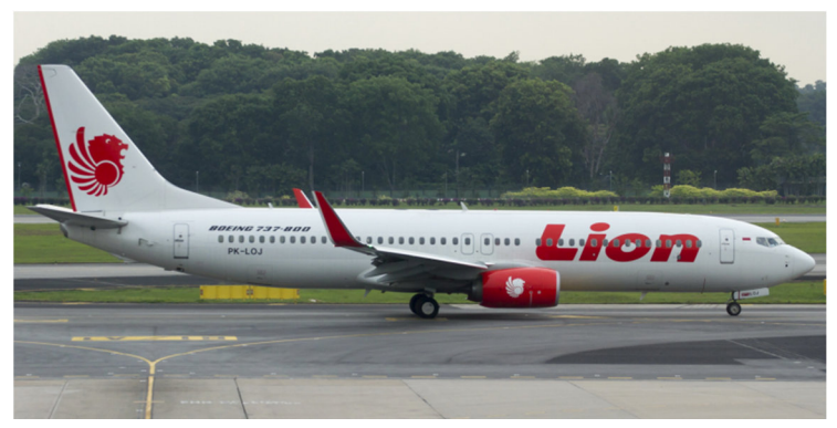
PK-LOJ - Lion Air - Boeing 737-800