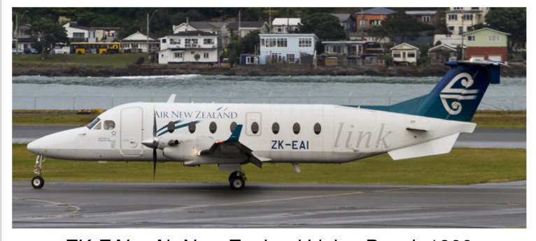
ZK-EAI - Air New Zealand Link - Beech 1900