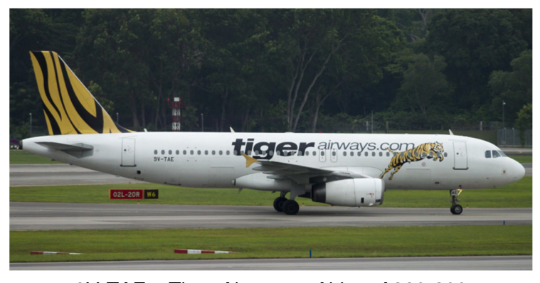
9V-TAE - Tiger Airways - Airbus A320-200