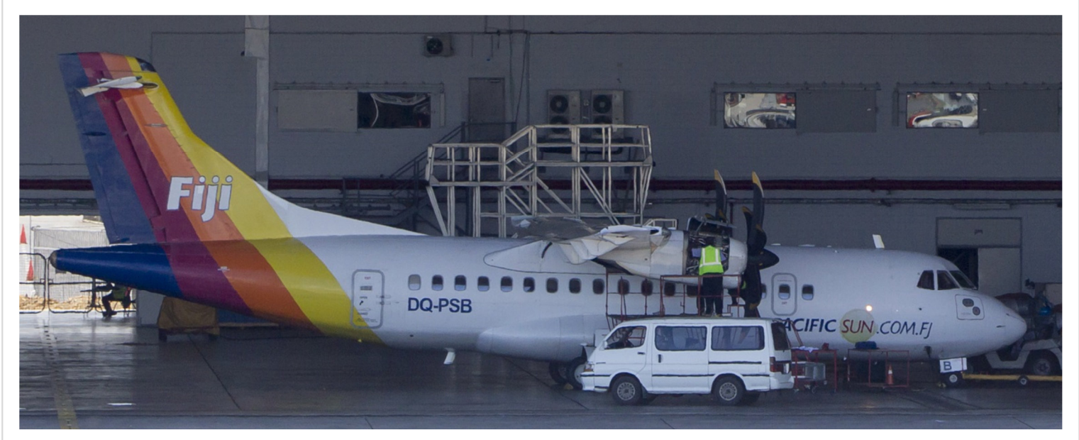
DQ-PSB - Fiji Airlines (Pacific Sun) - ATR 42-500